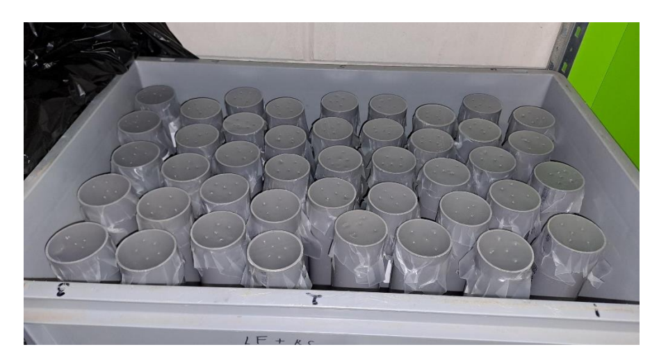
Figure 4: Tubes filled with soil and N-fertilisers in the soil incubation experiment

The fertilizing products, as well as the soil, were characterized and the N addition rate of these products to the tubes filled with soil was maintained as 170 kg N per ha. This value is based on the limit given in the Nitrates Directive (91/676/EEC) for manure products used as fertilizers in areas of Nitrate Vulnerable Zones.