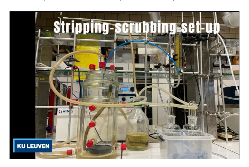
Figure 1: Stripping-scrubbing set-up, \underline{\textit{watch}} the experiment in action @KU Leuven

After anaerobic digestion of dairy manure, the resulting digestate is passed through an air-assisted stripping unit, which strips out the ammonia. This ammonia gas is then scrubbed in an acidic solution to produce ammonia salts, which are essentially nitrogen fertilisers. The quality of these fertiliser products will be assessed by UGent. The test setup is shown in Figure 1.